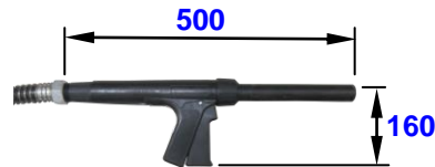
Typical Spray Nozzle Material : ABS Plastic