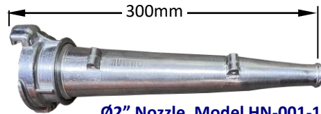
\varnothing 2'' Nozzle, Model HN-001-1V-50