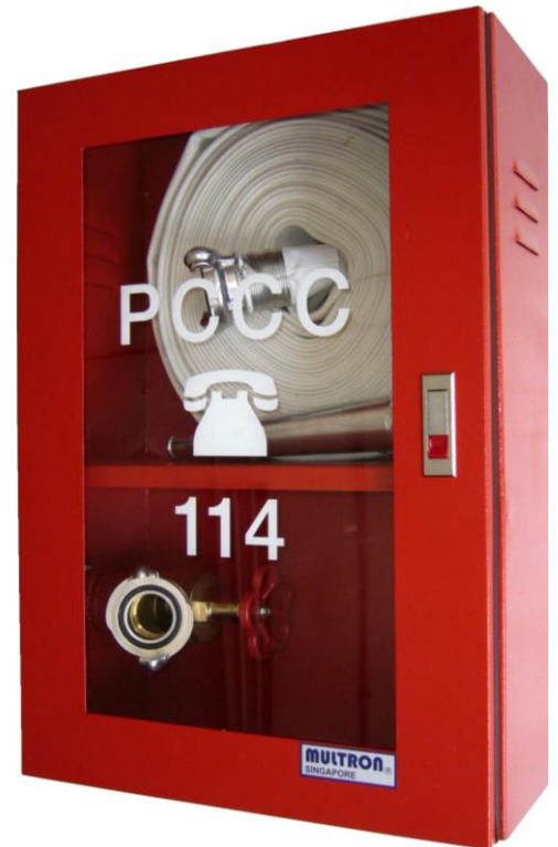
Fire Hose Cabinet Model FHC- 01V