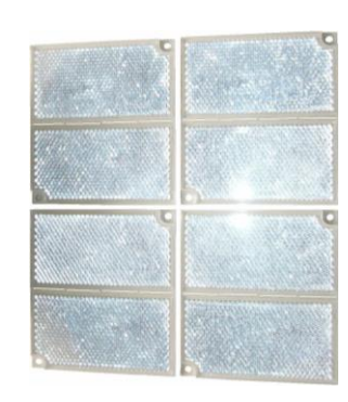
4 pcs. Reflector