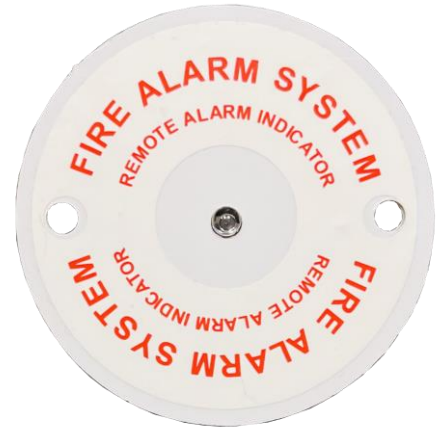
Detector Remote Alarm Indicator Model : DET-RL-03