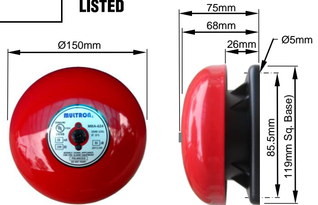
Alarm Bell MBA-624 Dimension