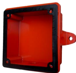
Back Box BBX-4 For Outdoor Installation (To be ordered separately)