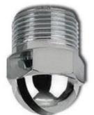
Water Curtain Nozzle SNCV Series (For Vertical Mounting)