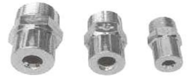
High Velocity Spray Nozzle SNHV Series Material : Chrome Brass

Medium velocity Water Spray Nozzle has an external deflector which discharges water in a directional cone shape pattern of small droplet size distributed uniformly over the protected surface. The nozzle is used in deluge water spray system for special hazard fire protection application.