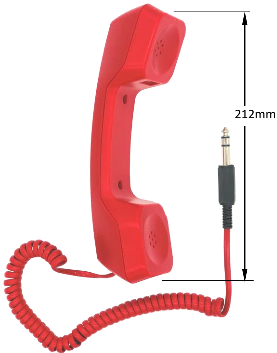
Portable Handset c/w Phone Jack Model : FI-95