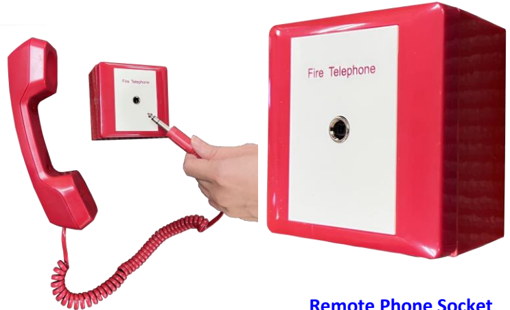
Remote Phone Socket Model : P-9911J

Remote Phone Socket P-9911J is designed for use in Fireman Intercom Systems normally found in large building installations. The units are to be used in conjunction with our Portable Handsets FI-95 carried by the Security Personnel for simple plug-in communication with the Main Fireman Intercom Panel.